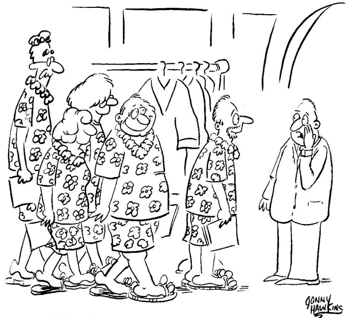
"May I have a word with you about the new summer choir outfits?"

Send her a card: c/o Porter Painting 109 S. White Street Hanford, CA 93230